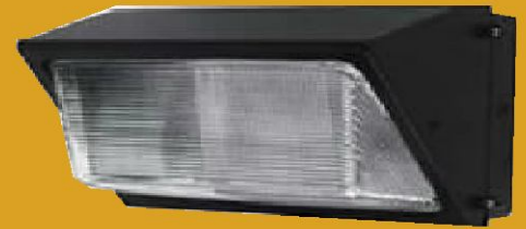
Replaces 250W (65CRI) Metal Halide fixtures.