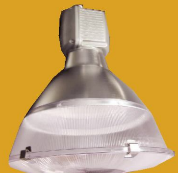
165W - 200W Miller Induction Fixtures are Commonly used to Replace 400W+ Metal Halide fixtures(65CRI) and 1000W+ HPS and Mercury Vapor fixtures (21CRI)

Uses: Shopping Centers, Theaters, Office, Lobby Areas, Libraries, Malls, Parking Garages, Warehouses, Parking Lots, Storage Facilities, Shops, Retail, Processing, Auto Dealerships, Conference Centers