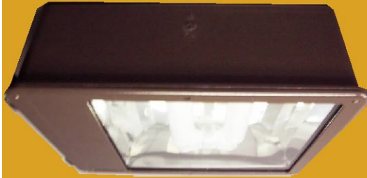
Commonly used to: Replace 400W+(65CRI) Metal Halide fixtures.