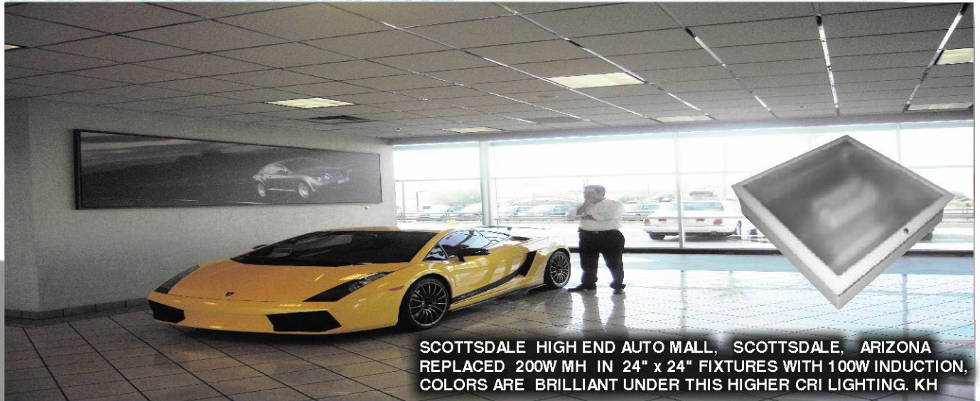
SCOTTSDALE HIGH END AUTO MALL, SCOTTSDALE, ARIZONA REPLACED 200W MH IN 24" x 24" FIXTURES WITH 100W INDUCTION, COLORS ARE BRILLIANT UNDER THIS HIGHER CRI LIGHTING. KH