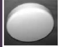
Low Profile 3"