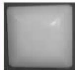
Low Profile 3"